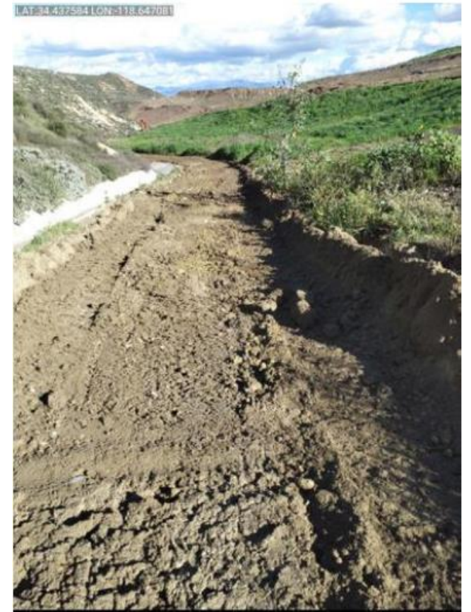
After - 2/21