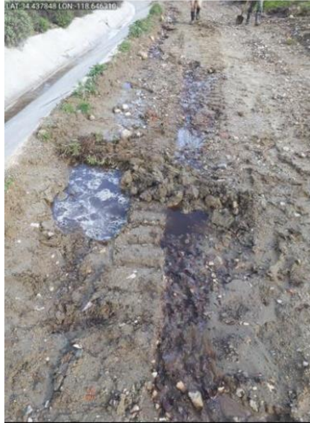
Before - 2/21